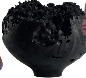
'Black Calyx' (2022) by Eleanor Lakelin at Sarah Myerscough Gallery