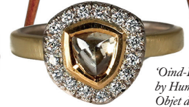
'Oind-R7' by Hum at Objet d'Emotion