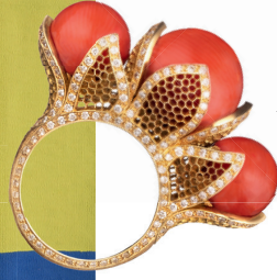
'L'Horizon Orange' ring by Dorothee Potocka at Objet d'Emotion by Valery Demure