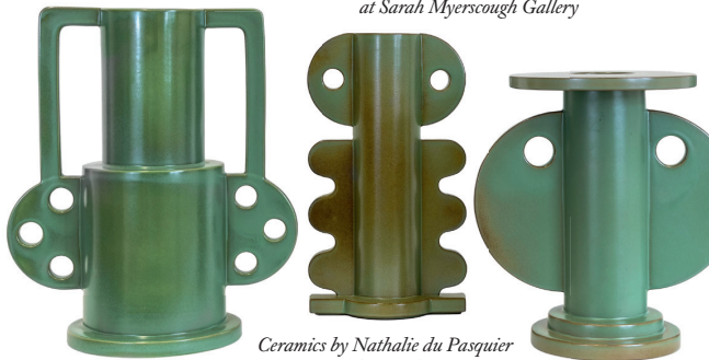
Ceramics by Nathalie du Pasquier at Galerie Italienne