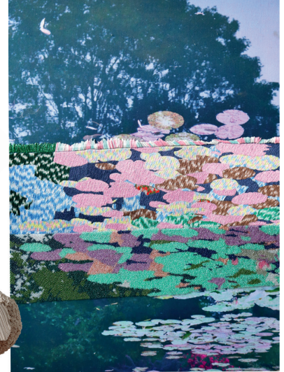
'Nymphéas' (2022) by Aurélie Mathigot at Maison Parisienne